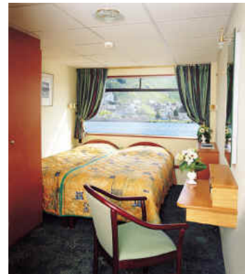
Typical cabin on m/s Douce France

To register for this tour, please contact: Macy's Group Travel 700 On the Mall, MS-750 Minneapolis, MN 55402 (612) 375-2881 or (800) 533-0324 email: jglad@macystravel.com