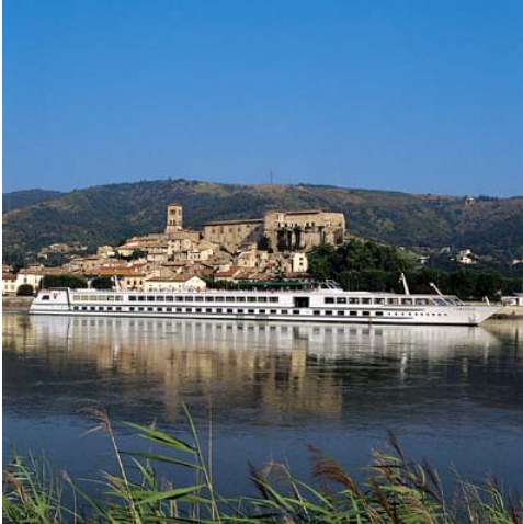
Our ship, the m/s Douce France