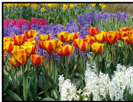
Flowers at Keukenhof

From the comfort of your upper deck cabin, you can see the best of Germany's heartland. The stretch of river from Rudesheim to Köln (Cologne) is famous for its scenery, with castles surviving from times when tolls were levied on the river's traffic, with landmarks such as the Loreley and the Drachenfels. This region of the Rhein averages one castle every two miles along this route. We overnight in several German cities along the way: in Koblenz and Düsseldorf. We have an afternoon stop in Köln, with time to visit the cathedral or just to enjoy the city on your own.