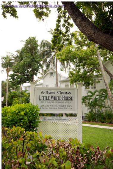
Harry W. Truman Little White House