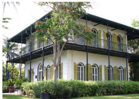
Ernest Hemmingway House in Key West