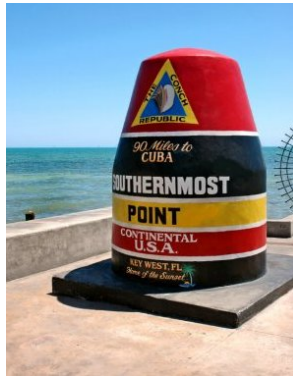
Southernmost City in Continental U.S.