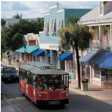
Famous Key West Trolley